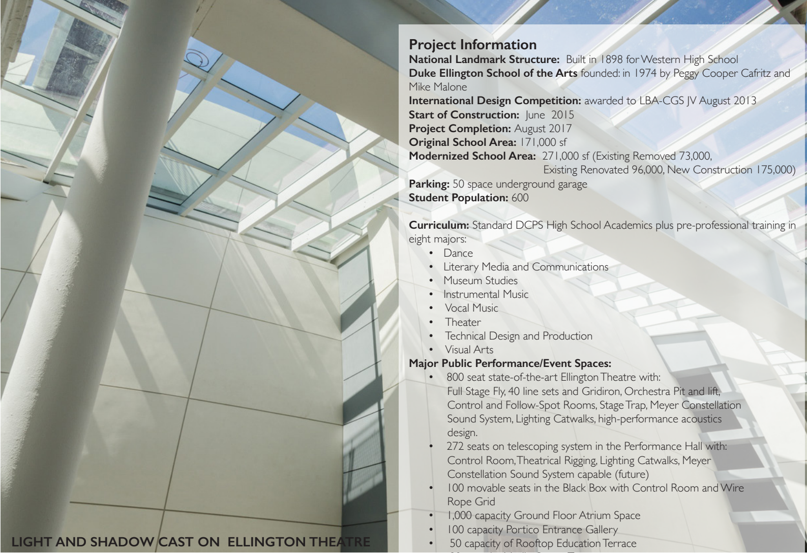
LIGHT AND SHADOW CAST ON ELLINGTON THEATRE