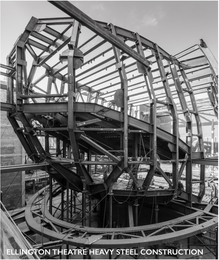
ELLINGTON THEATRE HEAVY STEEL CONSTRUCTION