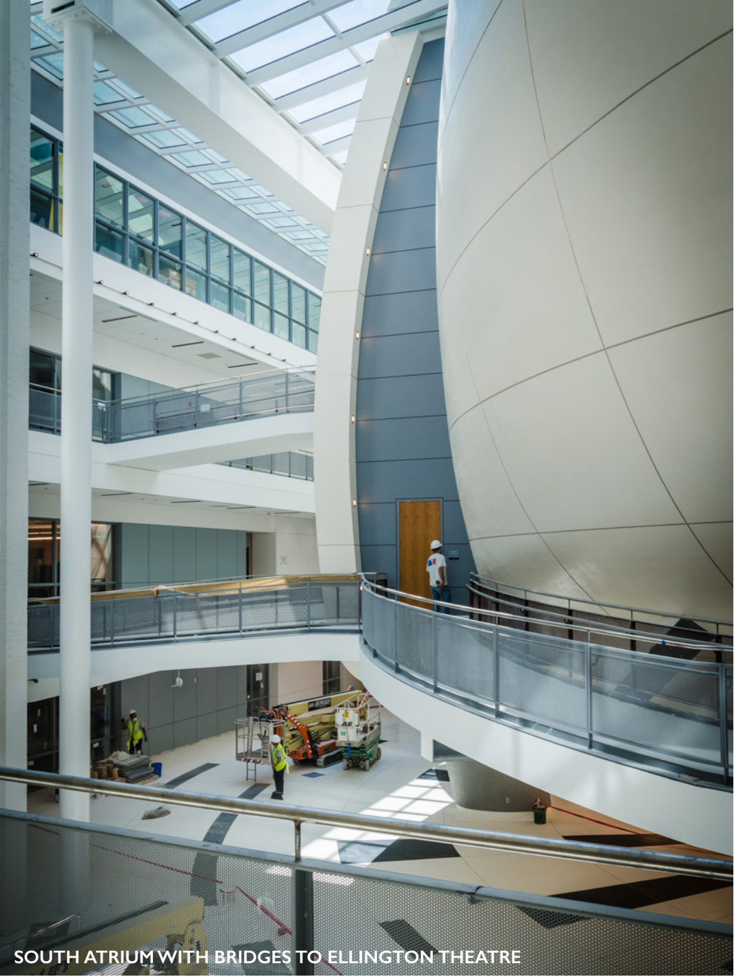
SOUTH ATRIUM WITH BRIDGES TO ELLINGTON THEATRE